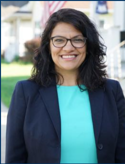
Rashida Tlaib At-Large